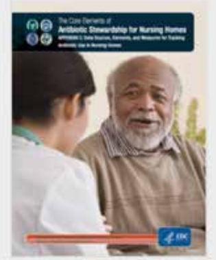
Nursing Homes Core Elements - Appendix-C

https://hidrive.ionos.com/share/c4jqzil.o7